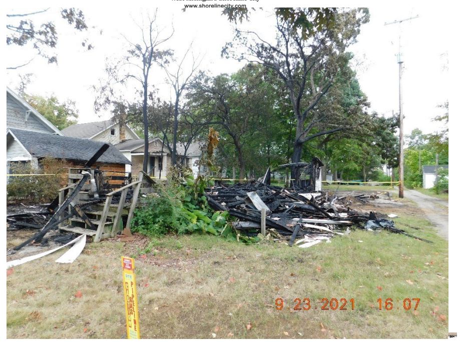
Property Information 181 Irwin Avenue Muskegon MI.

Asbestos Survey: Total loss fire. No asbestos survey has been completed.